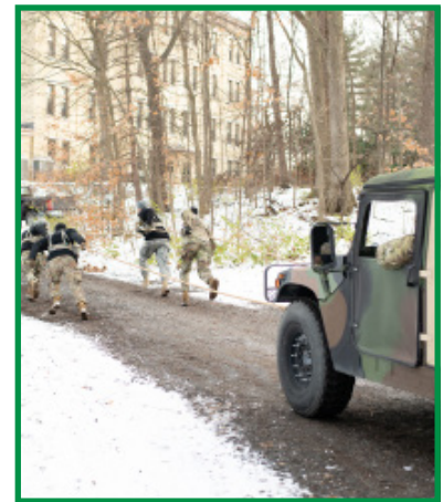
CDTs pull a Humvee together