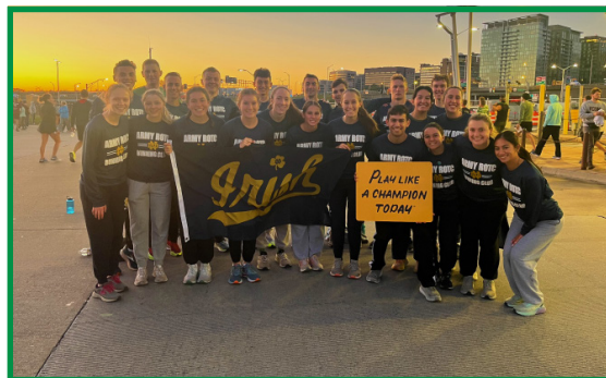
CDTs participate in the Army Ten Miler in Washington, D.C.