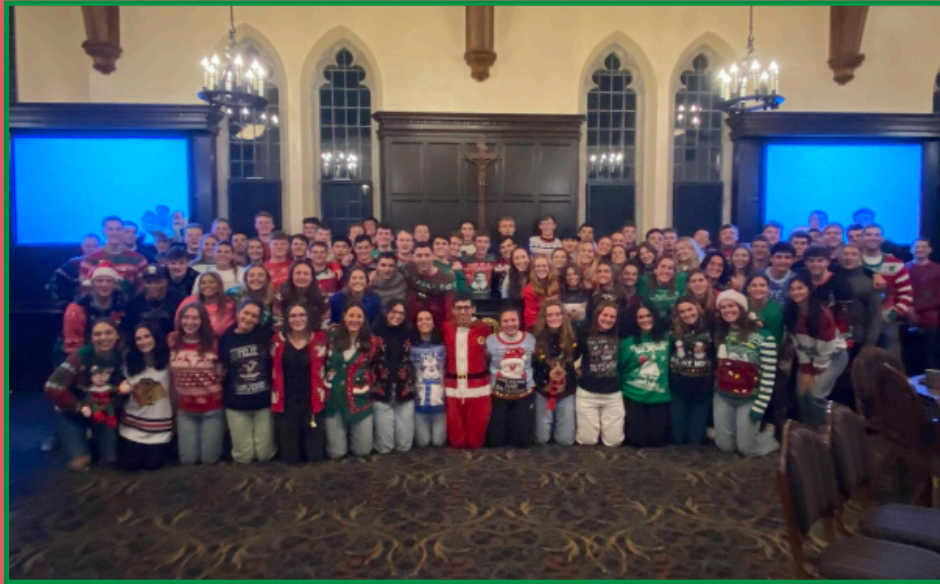
CDTs pose together at Five Leaf Clover Night in their Christmas sweaters