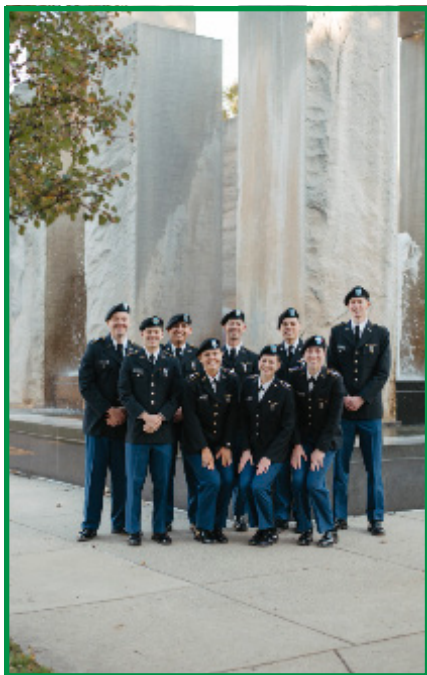
MSIV Cadets pose for a picture after the Veteran's Day Ceremony

This moving visual tribute serves as a reminder to students, faculty, and the Notre Dame community about the profound significance of the holiday.