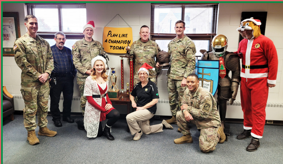
Fightin' Irish Cadre pose together