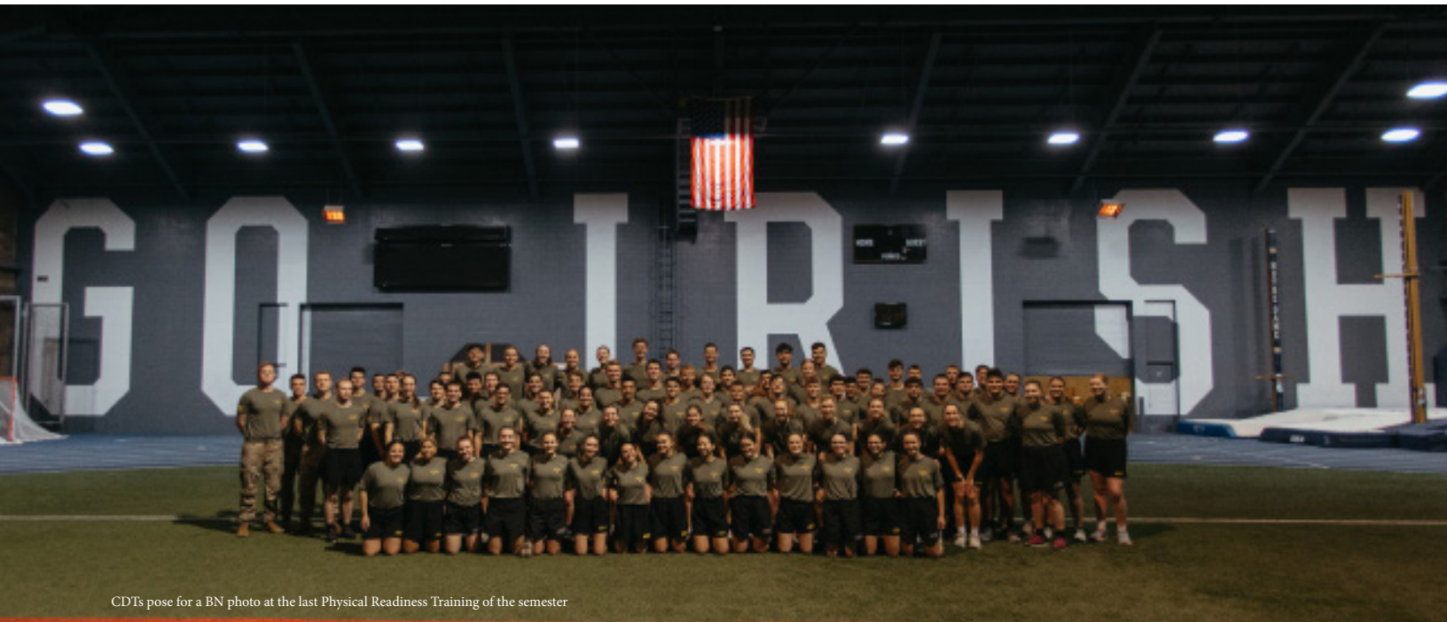
CDTs pose for a BN photo at the last Physical Readiness Training of the semester