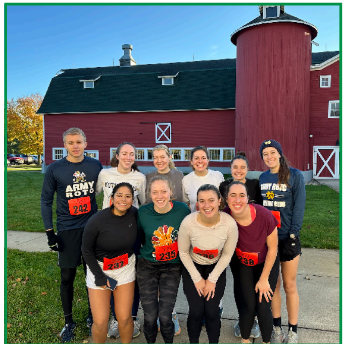
CDTs at the St. Joe Valley Happy Trail 10K