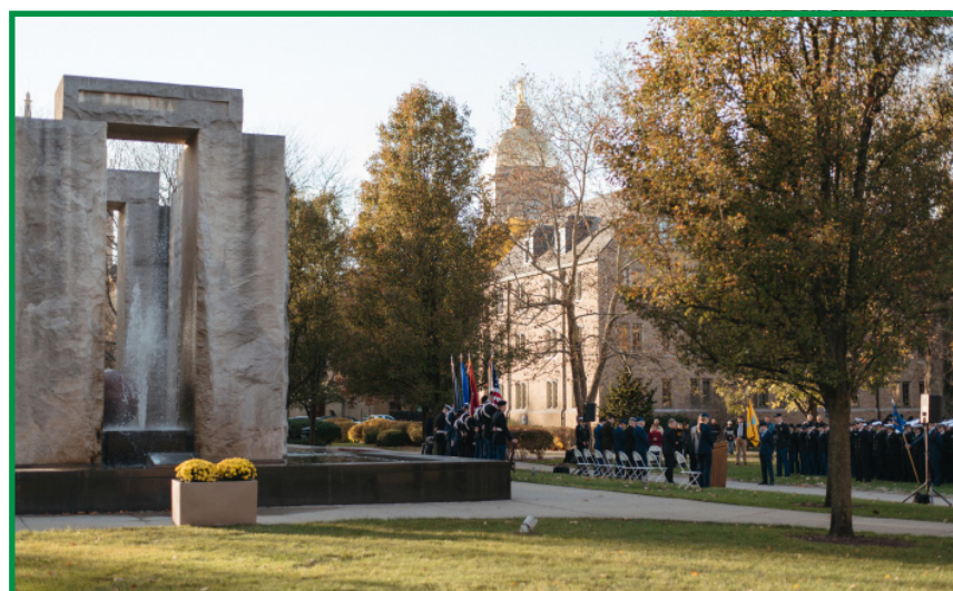
The Tri-Military Veteran's Day Ceremony at the Clarke Memorial Fountain