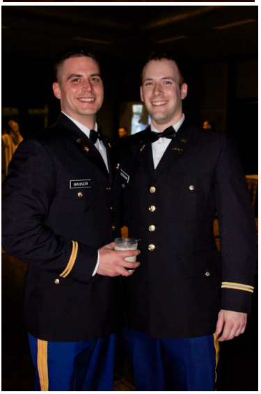
More photos on page 4!