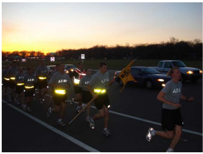
After the results had been calculated, the Bravo Company, led by c/Palm, on the Battalion Run

On 24 April 2007, the Fightin' Irish Battalion conducted its final PT session of the year. According to c/LTC Moran, it was the finest morning we have had all year to have PT, and it is the last PT session the MS IV's will have as a member of the Fightin' Irish Battalion. The PT session began with a light battalion run, a way to build esprit de corps. Each company belted out cadences and proudly displayed their guide-ons as the battalion went around the eastern edge of campus. Following the battalion run, each squad participated in a five by 400 race. Next, everyone divided into four groups and tried to be the last cadet standing to earn points for their respective platoon. The events were push-ups, leg lifts, flutter kicks, and jump rope. Everyone pushed themselves physically in order to reach the final four.