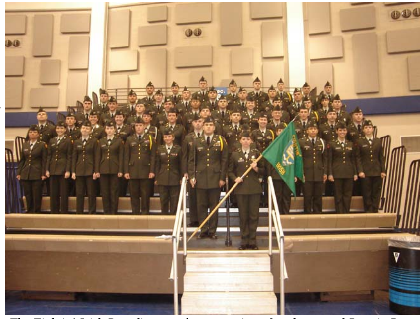
The Fightin' Irish Battalion stands at attention after the annual Pass in Review held 18 April 2007 at JACC

This year, the Pass in review was held at the JACC. The ceremony started at 1730 with the Navy Band playing patriotic marches. All the units wear their dress uniforms, looking sharp for friends and family members in the audience. The Fightin' Irish