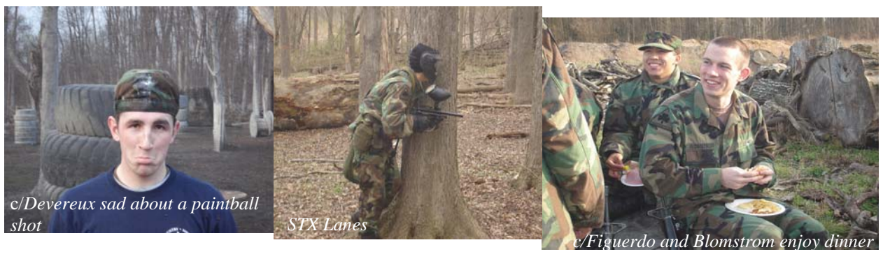
C/Mooney runs through the woods on a STX lane