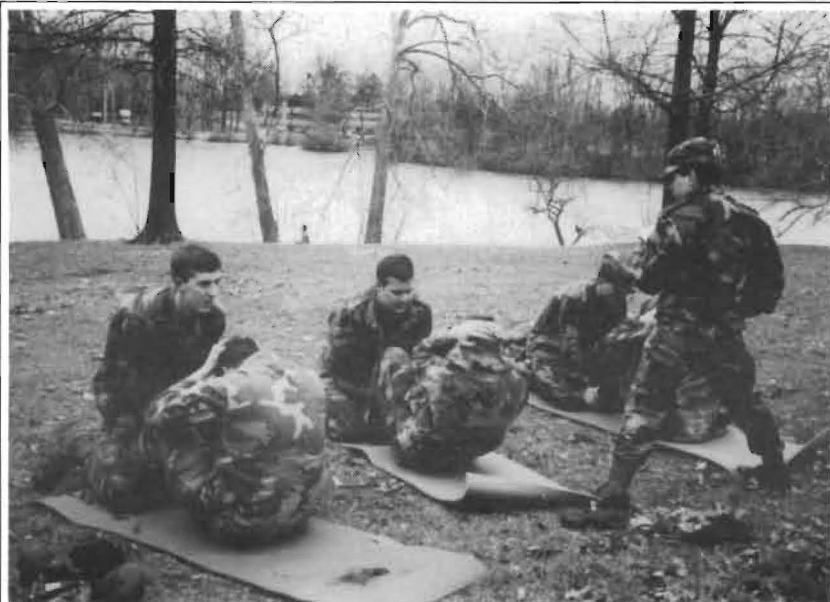
Members of Alpha Company grind sit-ups at the PT stage.