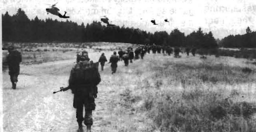
Camp Adventure 1991: Here We Come!