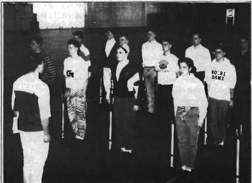
Practice pays off for the Irish Marauders