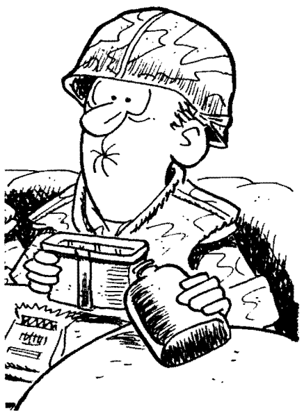
"Lemonade mix. All natural ingredients. No sweeteners added!"