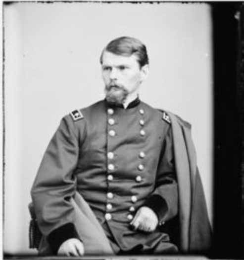
Emory Upton [ http://en.wikipedia.org/wiki/Emory_Upton ]

innovator, as influential to the Army as Mahan was to the Navy. The cadets at Notre Dame would have been training on, or at least reading, the latest in military theory.